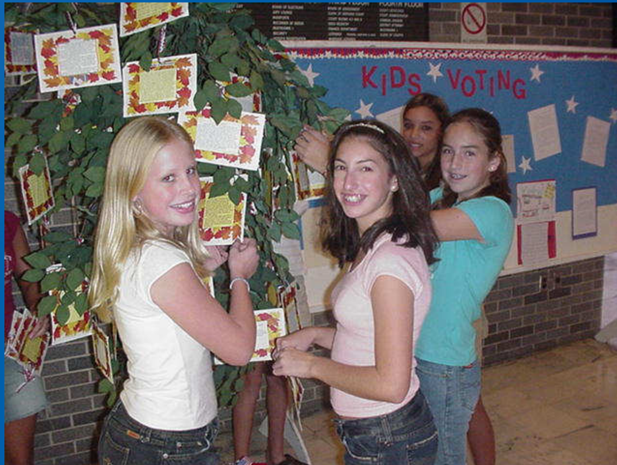
Central Bucks School District Holicong Middle School Wish Tree